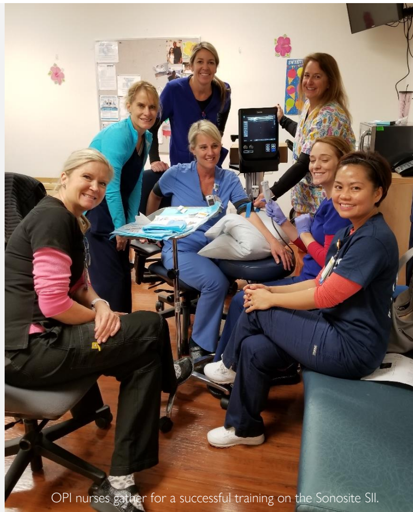
OPI nurses gather for a successful training on the Sonosite SII.